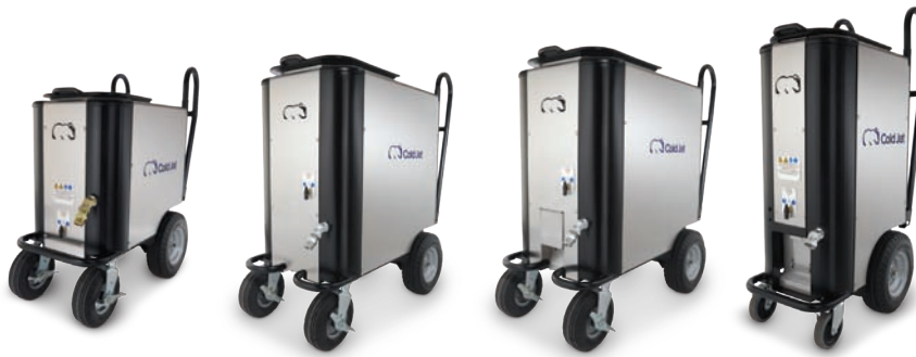
Aero 40/40 HP

The Aero Line offers superior performance and versatility with or without electricity. Regardless of the size of your project or budget, from the compact Aero 40 to the all-pneumatic Aero C100, Cold Jet has the right solution to meet your needs. Contact Cold Jet to determine the best solution for your application.