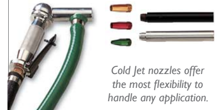
Cold Jet nozzles offer the most flexibility to handle any application.

Cold Jet nozzles are designed to deliver exceptional performance whatever the application.