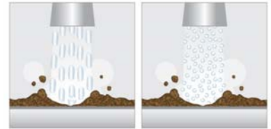
While pellets are most suitable when removing heavy, thick contaminants, shaved ice is ideal for cleaning thin hard contaminants, delicate substrates, intricate geometries or tiny openings.