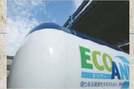
Our environment-friendly products include ammonia manufactured from used plastics.