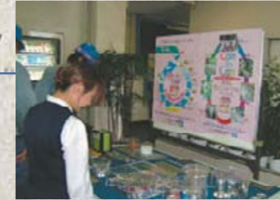
In-house exhibit of aluminum can recycling activities, aimed at increasing the employees' participation rate. (Kawasaki)