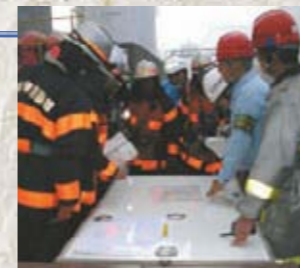
Joint disaster prevention drills are conducted in cooperation with communities and neighboring companies. (Oita Complex)

The Group attaches high priority to safe and stable operations as well as the principles of Responsible Care, aiming to eliminate accidents.