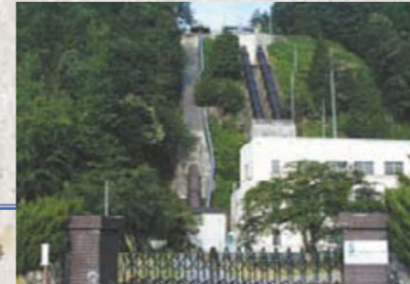
Approximately 20% of our total electricity requirements are now met by the four hydroelectric power plants we own and operate. (One of the four hydroelectric power plants, located in Nagano Prefecture)

The Group addresses the environmental protection issue from a global point of view, working hard to reduce the volumes of discharged chemical substances, wastes, and greenhouse gases.