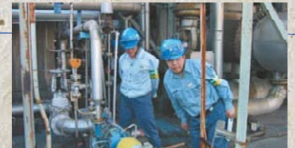
Plant workers carry out TPM autonomous maintenance and other safety programs to ensure our customers of the safety of our products. (Kawasaki)