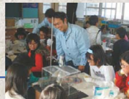
A chemistry experiment class at an elementary school in Oita, where our petrochemical complex is located.

We value people around us, making efforts to communicate better and improve friendly relations with them.