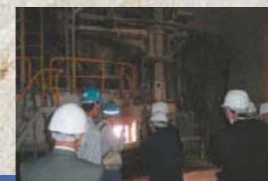
Plant tours are offered to residents at respective districts in which we operate. (Shiojiri)