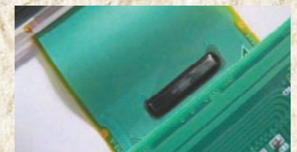
Thermoset solder resist for use in the manufacture of electronic parts based on the chip-on-film technology