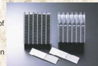
Aluminum automotive heat exchanger parts fabricated with Showa Denko's new refrigerant tube (NRT™) technology